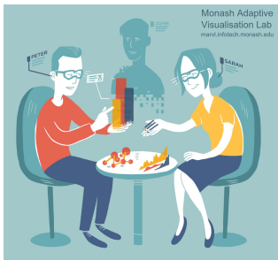
Figure 1: A possible use-case to be explored by immersive analytics: data analysis in Augmented Reality.

Real-World VA: What questions do technologies like augmented reality raise for visual analytics? Traditional information visualization supports open-ended exploration based on Shneiderman's information mantra: overview first, zoom and filter, then details on demand. In our view a different model is required for analytical applications grounded in the physical world. In this case objects in the physical environment provide the immediate and primary focus and so the natural model is to provide detailed