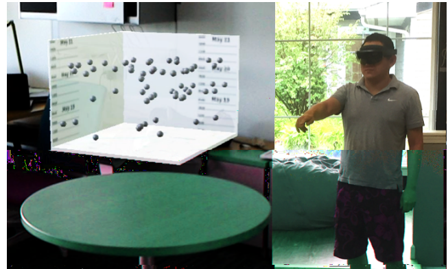
Figure 1: Space-time cube hologram in an AR environment as seen through a HoloLens (L). Participant wearing the HoloLens (R).

cognitive utility of 3D visualizations, as advanced display formats, such as holograms, may not suffer from the same disadvantages as 2D displays.